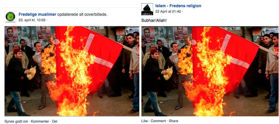
Figure 2. Pictures of burning Danish flags on two fake Muslim Facebook pages.

The constructed logics of violence, exploitation, hypersexuality and conspiracy connect to a fifth overarching logic, namely incompatibility . Muslims are fundamentally incompatible with Danes and Danish society, meaning that 'the Muslim' is constructed as the exact